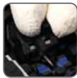
Simply exchange of electrodes