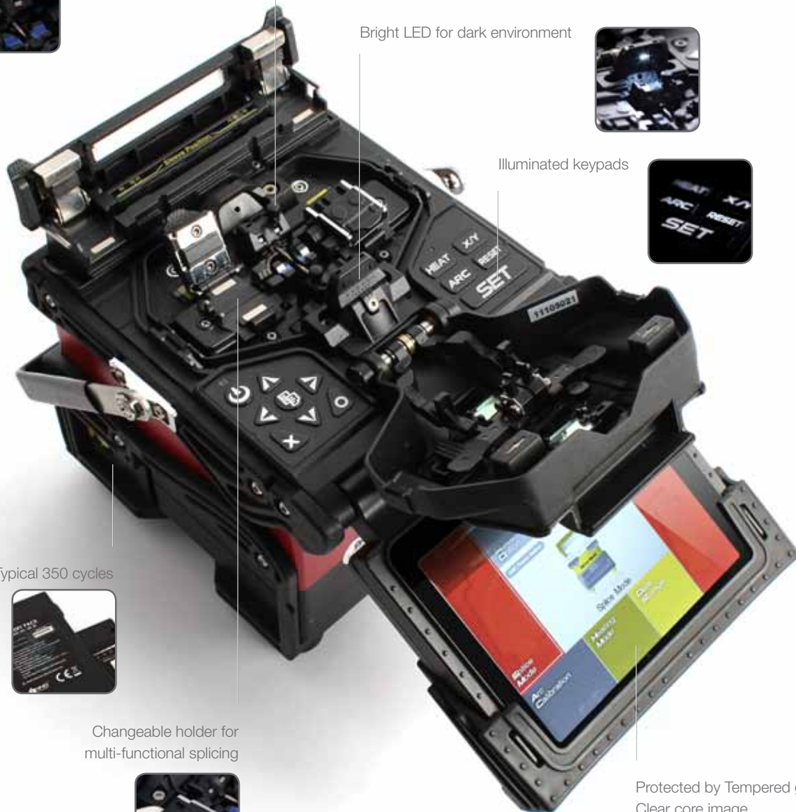
Battery : Typical 350 cycles